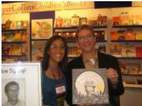
Kevin Henkes •Author of Olive's Ocean & Kitten's First Moon