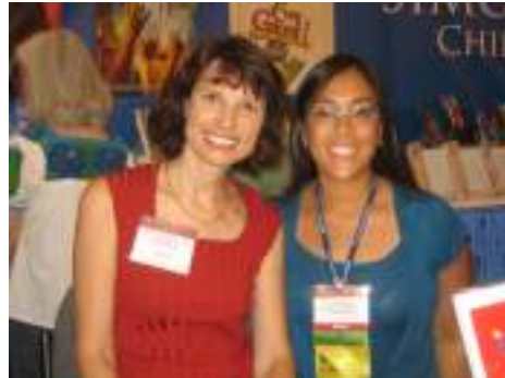
Margaret Peterson Haddix •Author of the Shadow Children Series

ALA offers opportunities to meet authors! Check your program to see who will be there! You never know, your favorite author just might be signing books!